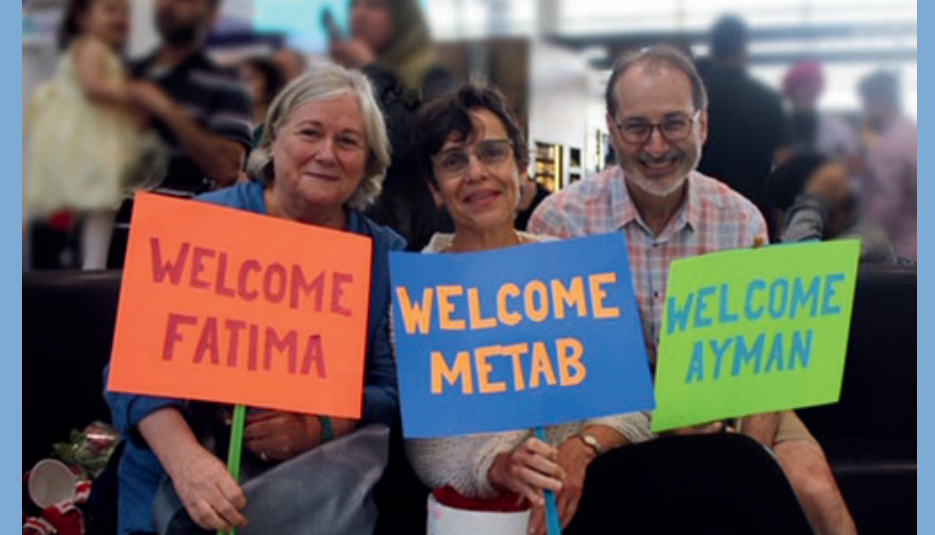
Sponsored refugees are welcomed by their sponsors at the airport, where they become Permanent Residents of Canada.

AURA is a Canadian charitable organization providing support and expertise to groups involved in refugee sponsorship and resettlement. We manage a refugee sponsorship agreement held in partnership with the Anglican Diocese of Toronto.